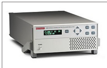
Keithley Model 2306-VS